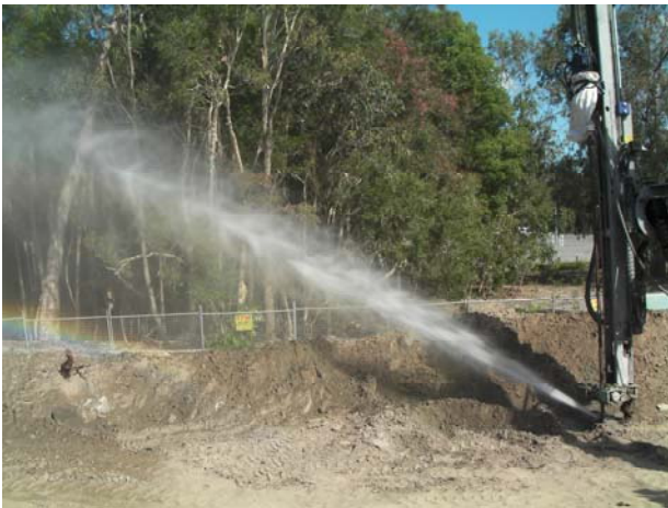
High pressure grouting was used to increase micropile diameters in upper soil layers