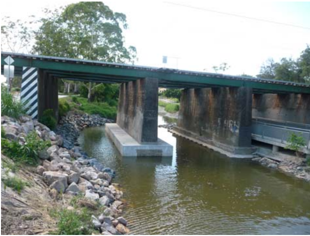
Completed foundation repair